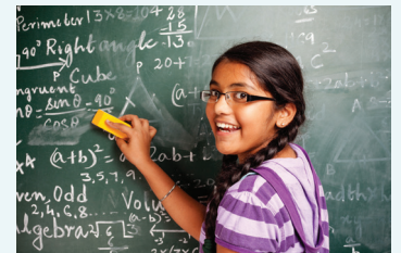
Simulated representative view

The lenses rest gently on the eye to slightly flatten the cornea which temporarily corrects vision and allows children to be glasses-free throughout the day. 5,6